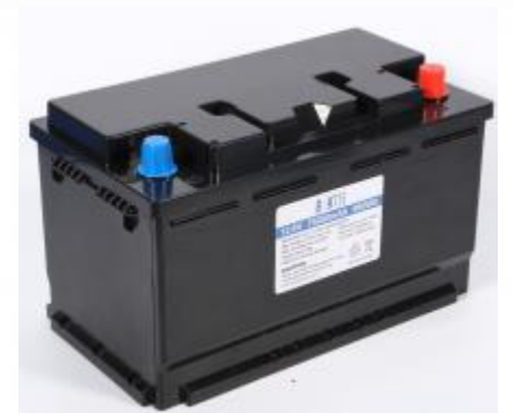
LiFEPO<sub>4</sub> battery pack 12V 120Ah External Power supplier for Camera

18650 battery pack 36V 4.4Ah for electronic Scooter