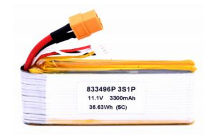
Lipo battery pack 11.1 3.3Ah for Helicopter