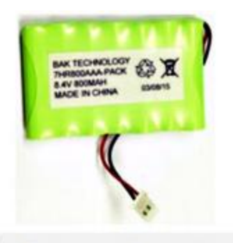
For security system