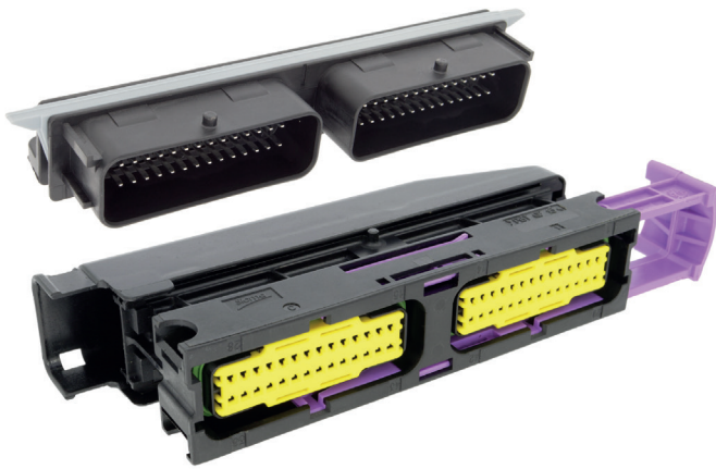
SICMA Full Interconnect Sealed 56 Way