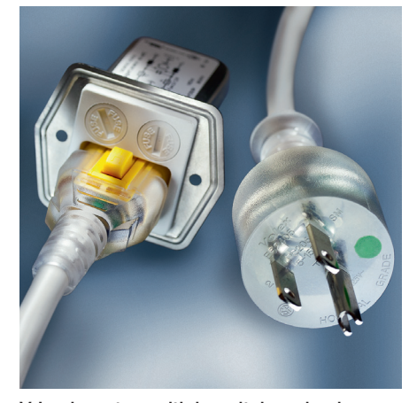
V-Lock system with hospital grade plug

Medical devices can be connected directly to the mains or with a detachable power cord. Such plug connections must meet the requirements of Standard IEC 60320. Depending on the application, it is recommended to include a