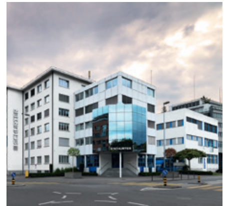
Headquarters in Lucerne