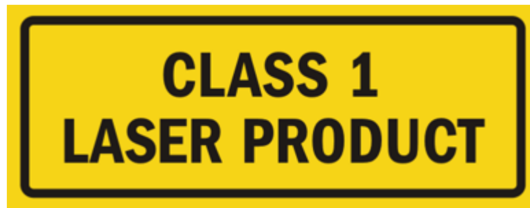
Figure 1. Class 1 laser product label

The VL53L5 contains a laser emitter and the corresponding drive circuitry. The laser output is designed to remain within Class 1 laser safety limits under all reasonably foreseeable conditions including single faults in compliance with IEC 60825-1:2014 (third edition). The laser output will remain within Class 1 limits as long as the STMicroelectronics recommended device settings are used and the operating conditions specified in the STM32U5 datasheets are respected. The laser output power must not be increased by any means and no optics should be used with the intention of focusing the laser beam. Figure 1 shows the warning label for Class 1 laser products.