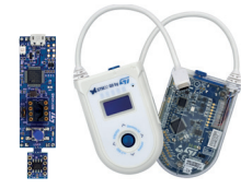
STM32G0316-DISCO / STM32G071B-DISCO (USB Type-C™) Discovery Kits