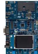
STM32G081B-EVAL STM32G0C1E-EV Evaluation boards

A full set of evaluation boards enables flexible prototyping as well as full STM32G0 evaluation.