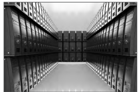
Server and Storage Room