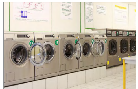
Laundry Equipment (washers and dryers)