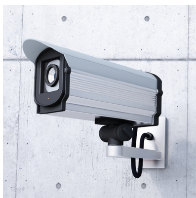
SAFETY AND SECURITY DEVICES