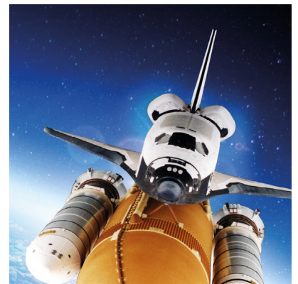
MIXED SIGNAL DEVICES