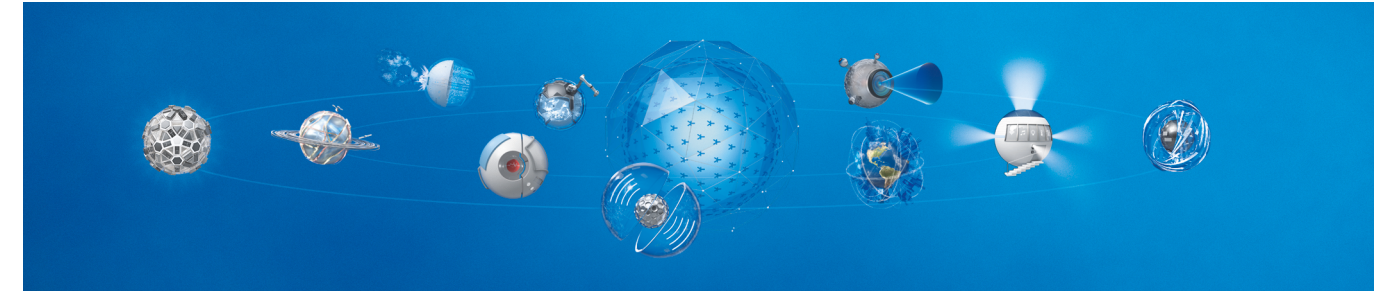
Version 01, September 10, 2020