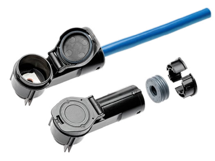
48V Sealed Ring Connector