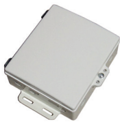
• DCE 7x6x2

The Die-Cast Enclosure (DCE) series offers a directional VPOL panel antenna that is contained within a die-cast aluminum enclosure. The enclosure adds to the long life of the antenna in outdoor environments. The powder coat paint over aluminum construction offers unsurpassed resistance to corrosion. The die-cast enclosure has extra heavy duty mounting flanges for reliable mounting to poles or surface mounting to walls along with the inclusion of seven engineered hole knockouts which allow for many different configurations of connectors and feedthrus without the need for drilling holes.