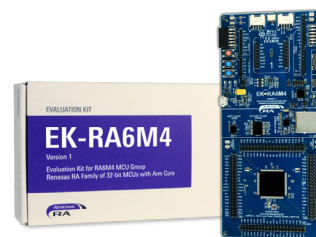
Evaluation Kit: EK-RA6M4