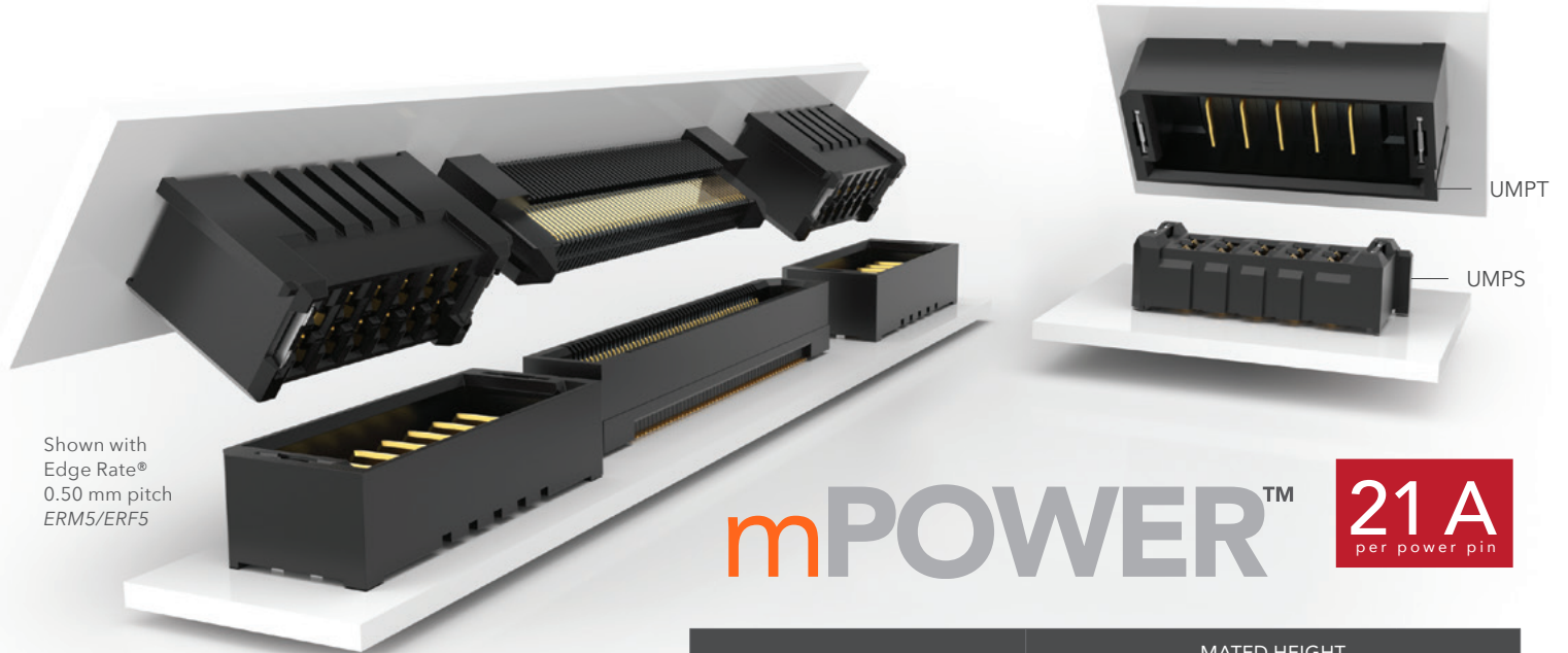
Shown with Edge Rate® 0.50 mm pitch ERM5/ERF5