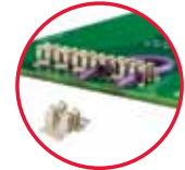
Griplet™ Miniature IDC