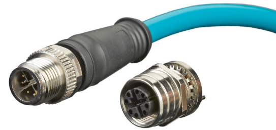
Micro-Change ® M12 CAT6 A Cable and Receptacle

Allows for automated assembly process for attaching the receptacle to the PCB