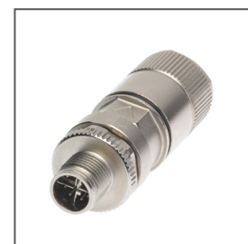
Micro-Change ® M12 CAT6 A Field-Attachable Connectors