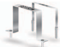
Open Air Shunt Resistors