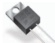
Thick Film High Power Resistors