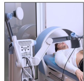
Diathermy Therapeutic Device